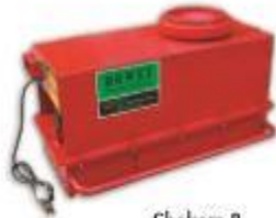
Shakers & Other Equipment