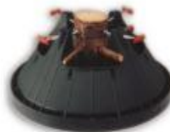
Stands - Cinco, Yule Tree, Gunnard and More