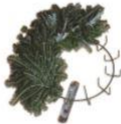
Clamp-Type Wreath Frames & Machines