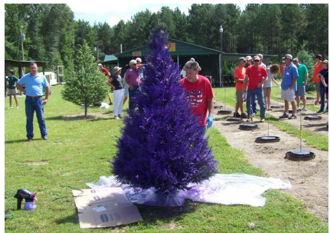
Beginning the color application on a Leyland Cypress